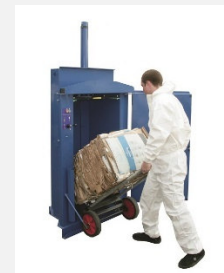
Bale Lifting Trolley