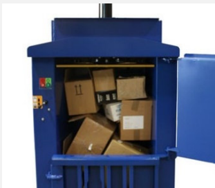
High compaction ratio and large fill chamber