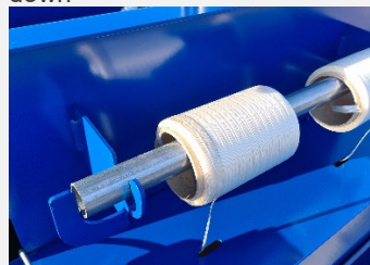
Bracket for two spools bale strapping