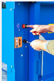
Lever-control for packing plate up and down